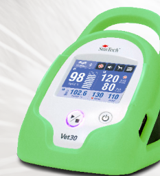
Vet30 Continuous Vital Signs Monitor