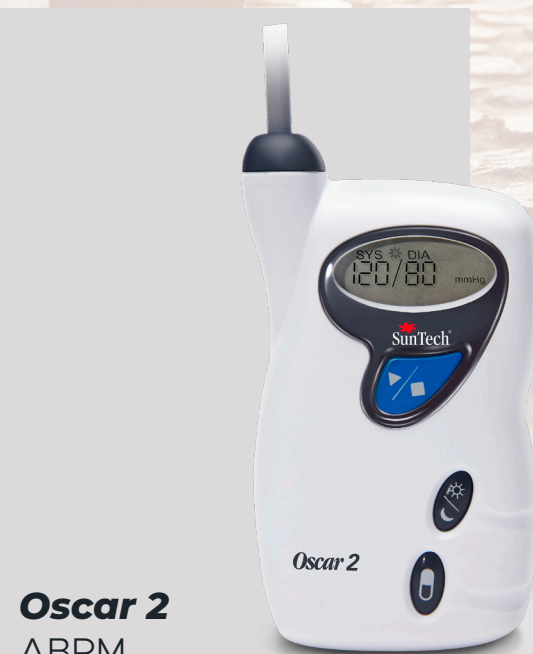
Oscar 2 ABPM

Diagnosing and treating hypertension is serious business, and as research shows, Ambulatory Blood Pressure Monitoring (ABPM) is far superior to other testing available to clinicians*. Our ABPM devices provide valuable blood pressure information that in-clinic and pharmacy-grade home blood pressure devices are incapable of measuring. The SunTech Oscar 2 is validated to all 3 internationally recognized protocols. Setting the standard across the globe, our proprietary, motion-tolerant technology is combined with the gold standard in central blood pressure measurement from AtCor Medical.