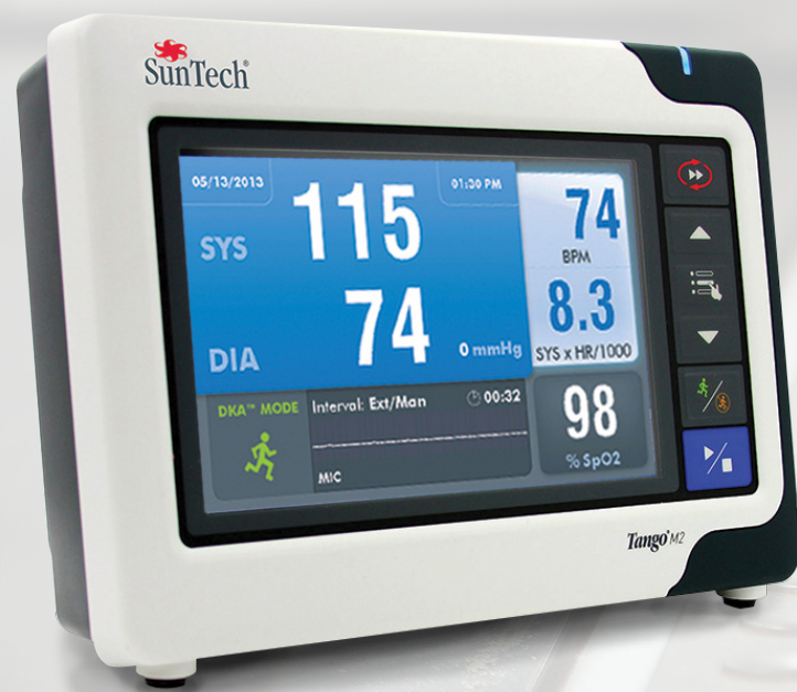
Tango M2 Stress BP

The Tango M2 stress BP monitor provides accurate, reliable BP measurements and relieves you from having to take manual BP measurements during a stress test – so you can focus more on your patient.