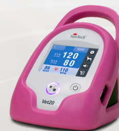
Vet20 Spot-Check BP Monitor

The Vet20 is the simplest way to get a BP on an awake cat or dog. The Vet25 is designed to be flexible – for measuring BP in either the exam room or the operating room. The Vet30 combines our trusted BP technology with oxygen saturation and temperature monitoring for animals pre-, post-, or during a procedure.