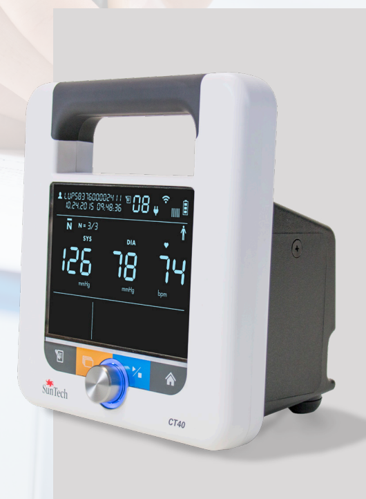
CT40 Advanced Spot Vitals

Easily incorporated into your clinical workflow, SunTech has created clinical-grade BP devices, designed to be the answer you are looking for. SunTech vitals devices provide clinical accuracy and HL7 data connectivity with intuitive, easy-to-use design that make your job easier and more productive.