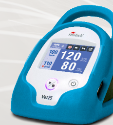
Vet25 Spot-Check and Continuous BP Monitor